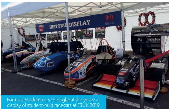
Formula Student cars throughout the years: a display of student-built racecars at FSUK 2019.

The logistics involved in taking part in the event can be daunting even for a professional racing team, let alone a student-run one, and the amount of work that teams put into making everything